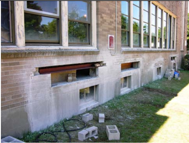
Inspection of exterior masonry condition. Removal of brick and concrete.