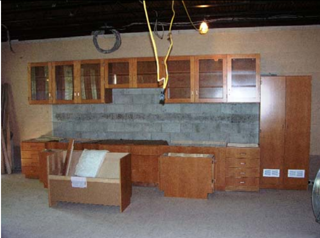
Casework at science room is in place