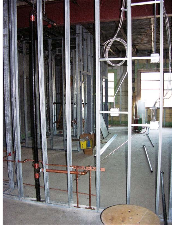
Second Floor Teacher's Room framing, rough plumbing, electrical, and HVAC.