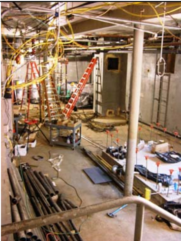
Installation of plumbing and electrical ongoing.