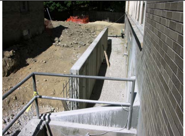
Exterior concrete partition 70 percent complete.