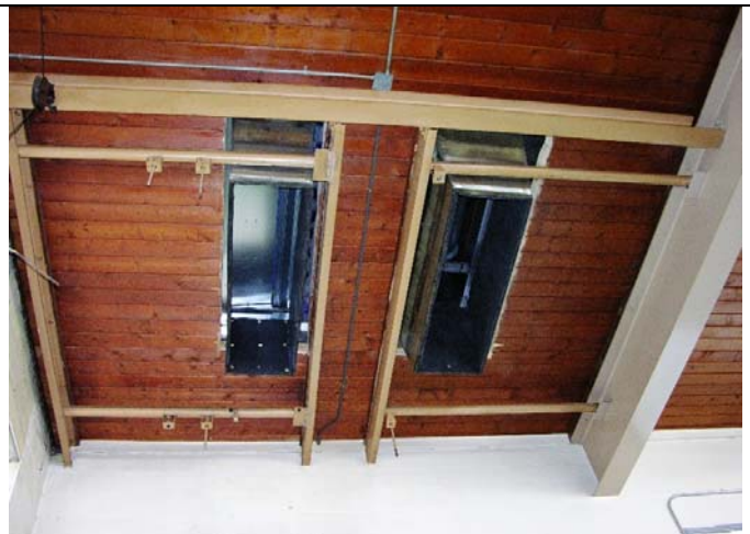
Roof top units placed, roof penetrations performed.