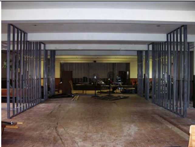
Installation of metal framework for partition walls along corridor 90 percent complete.