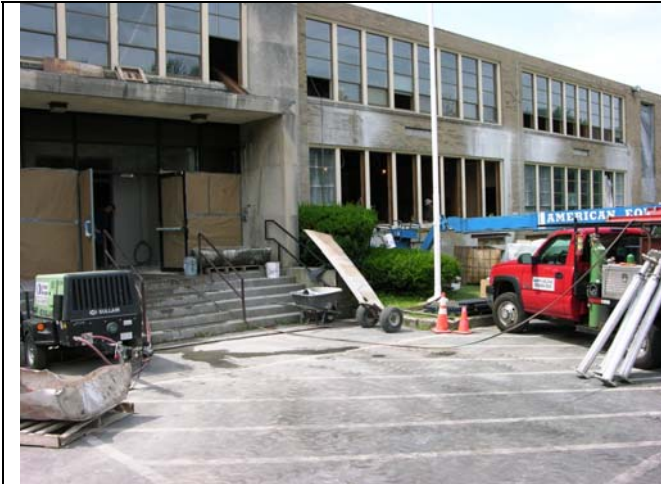
Removal of existing windows ongoing.