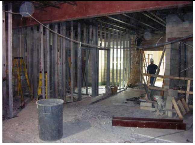
Metal framework of partition walls along corridor.