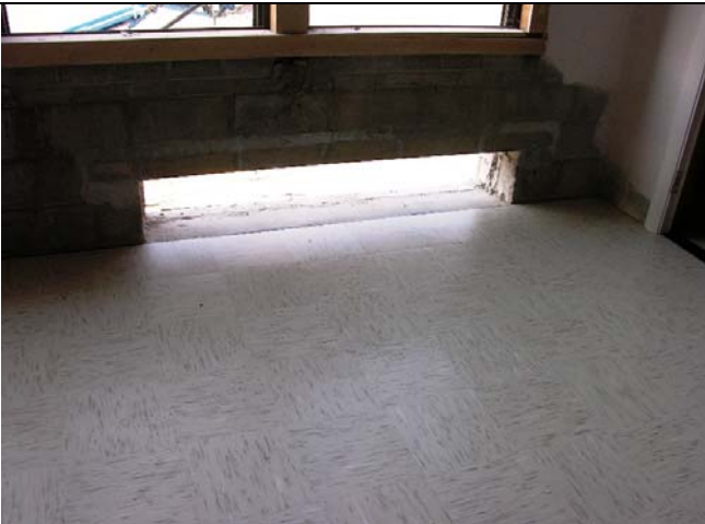
Unit ventilator openings. Floor leveling in place. VCT installations have begun.