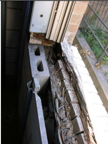
Existing window treatment with removal of lintel.