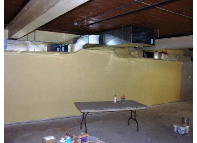
Ductwork Installation is ongoing at basement level.