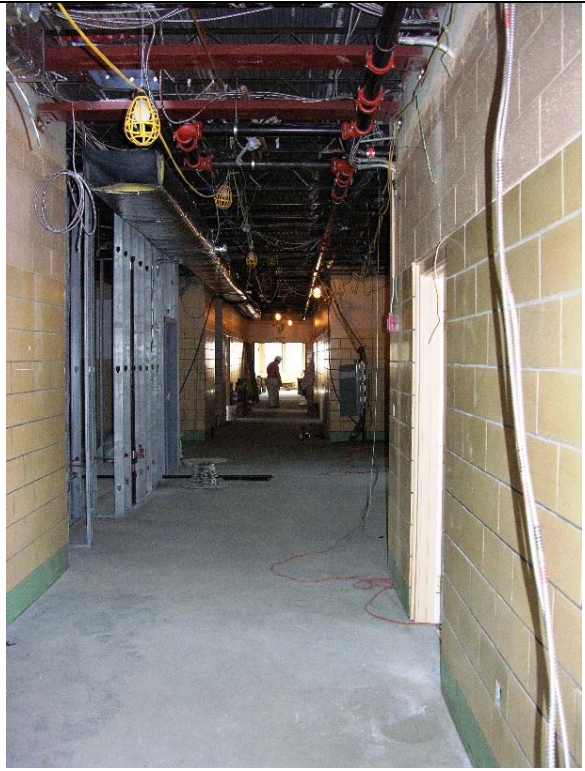
Masonry wall and steel framing installations complete.