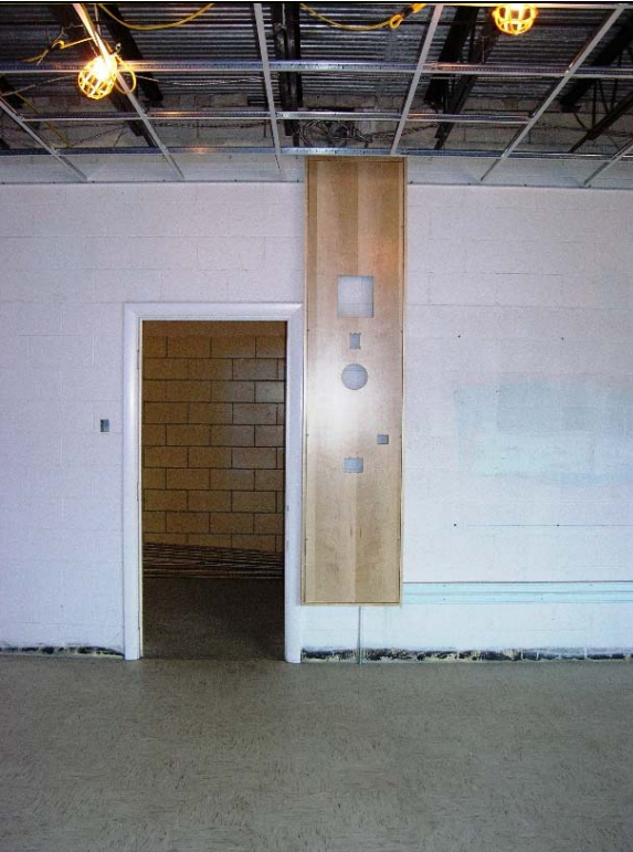
Clock console installations. Acoustic Tile Grid installed at classrooms.