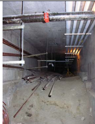
Plumbing and HVAC inspection in crawlspace.