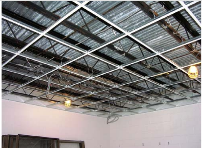
Acoustic Grid in place. Interior finishes in place.