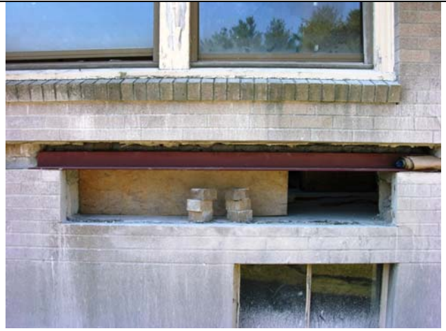
Exterior masonry removal ongoing.