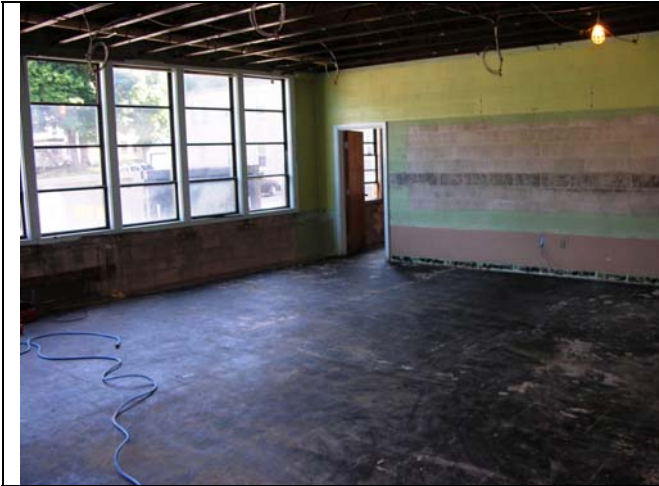
Unit inspection. Sub floor insulation ongoing.