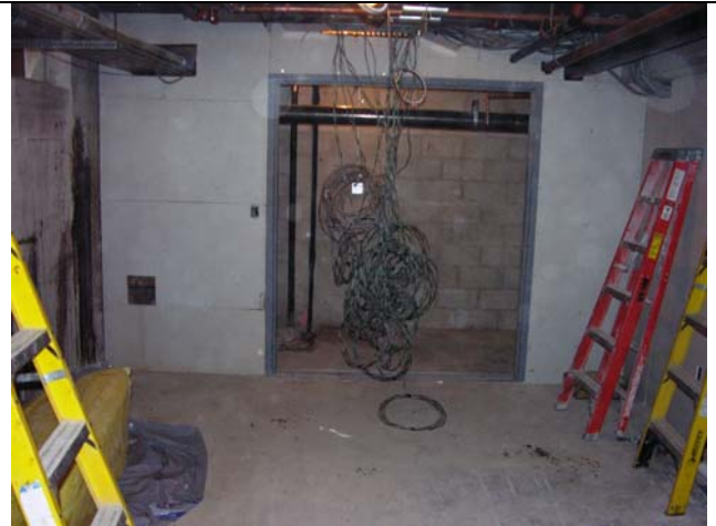
Exposed electrical from ceiling.