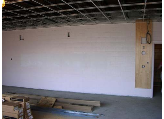
Acoustical Ceiling Grid Installation has commenced.