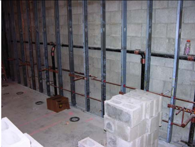
Metal framework and rough plumbing complete.