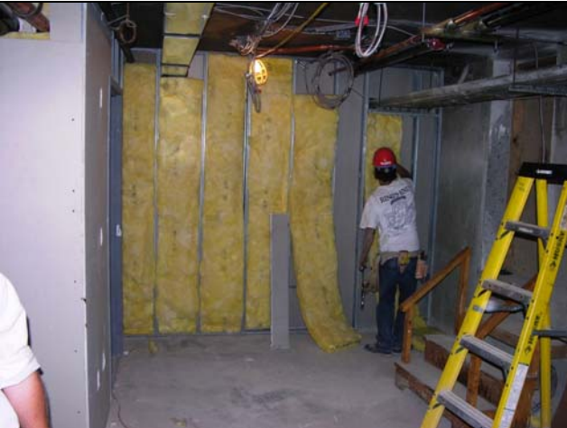
Insulation applied to metal framework in place. Sheet rock insulation ongoing.