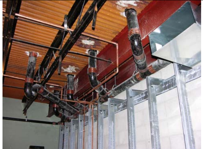
Rough plumbing, HVAC and metal framework complete.