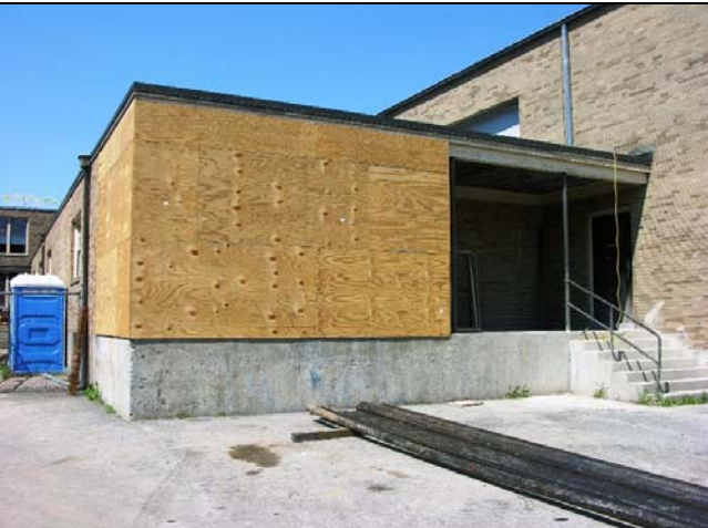
Cold storage room off kitchen is framed and sheathed.