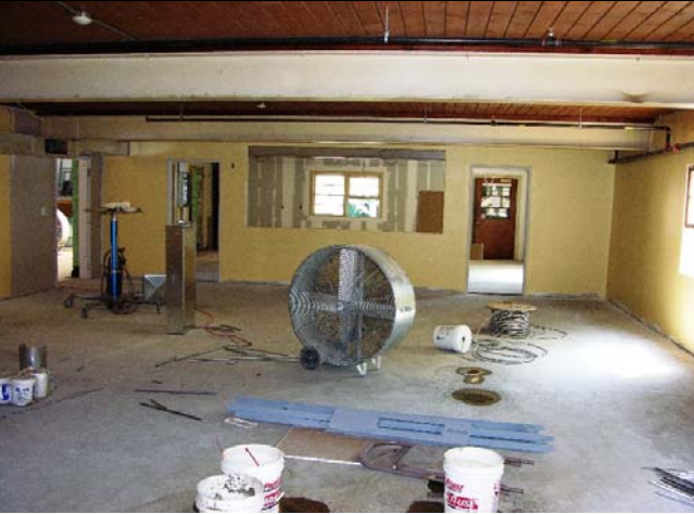
Finish work at cafeteria is ongoing.