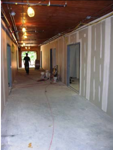
Sheet rock installation complete. Rough electrical and plumbing ongoing.