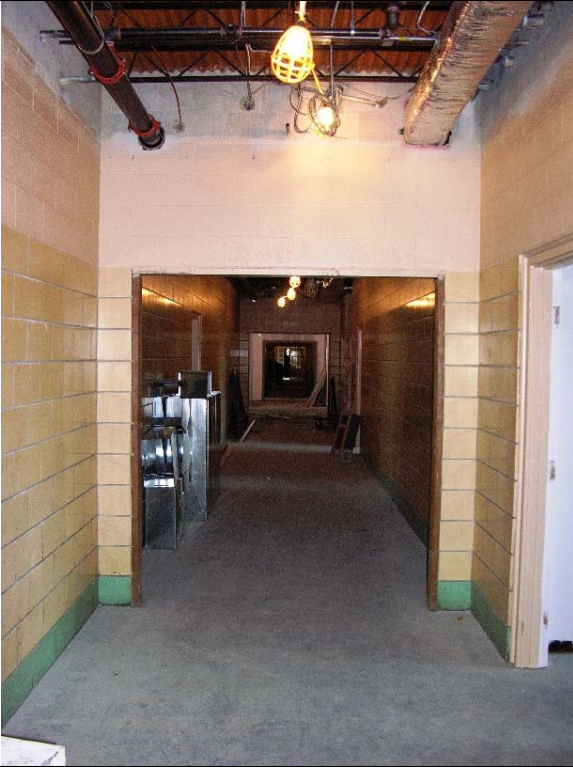
HVAC duct installation/insulation in progress.