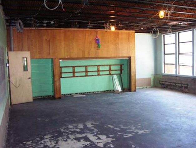
Unit inspection. Sub floor insulation ongoing.