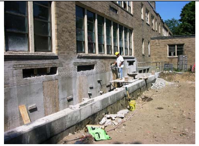
Through-wall sleeves and grills/registers are ready for installation.