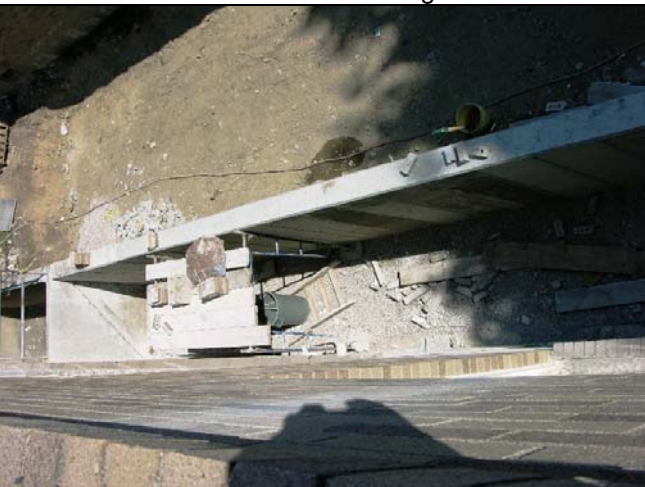
Forming and pouring of concrete at areaway stairs and walls continues.