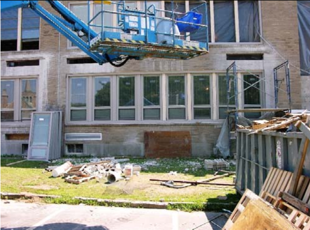
Window installation continues at first floor.