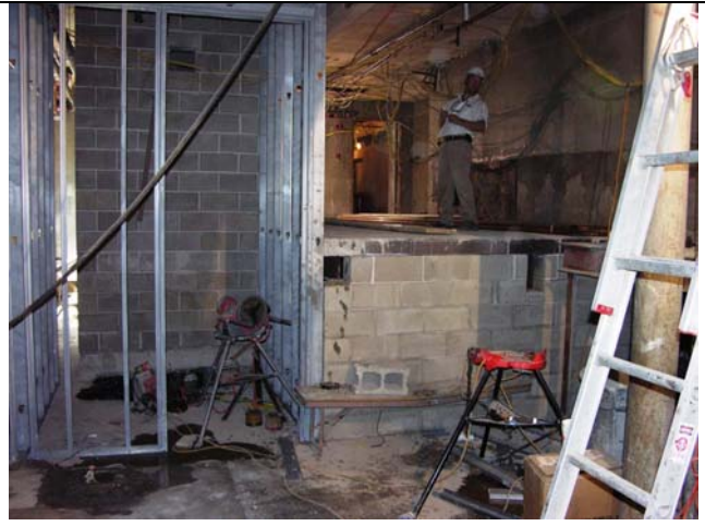
Removal of concrete and installation of metal framework ongoing. Exposed existing electrical.