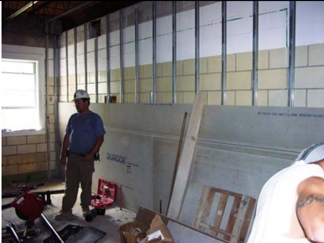
Metal studs applied to existing concrete wall and installation of sheet rock ongoing.