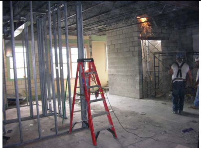
Inspection of framework and exposed steel trusses.