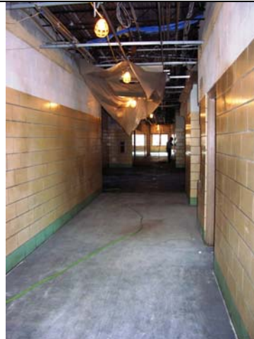
Removal of hung ceiling and exposed plumbing and electrical along corridor.