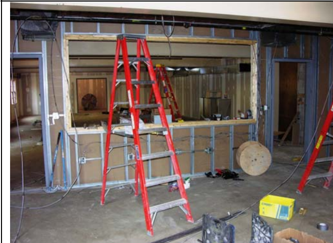
Existing window treatment with removal of lintel.