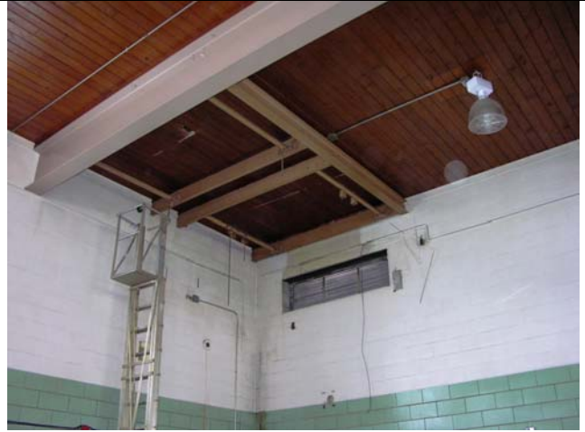
Removal of hung ceiling and exposed plumbing and electrical along corridor.