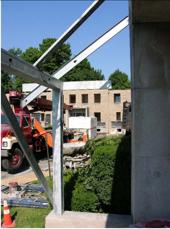
Canopy construction has commenced.