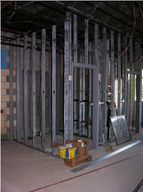
Framing of toilet rooms at teacher's room complete. Rough plumbing, HVAC, and electrical complete.