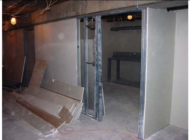
Corridor/unit inspection. Installation of sheet rock applied to metal framework.