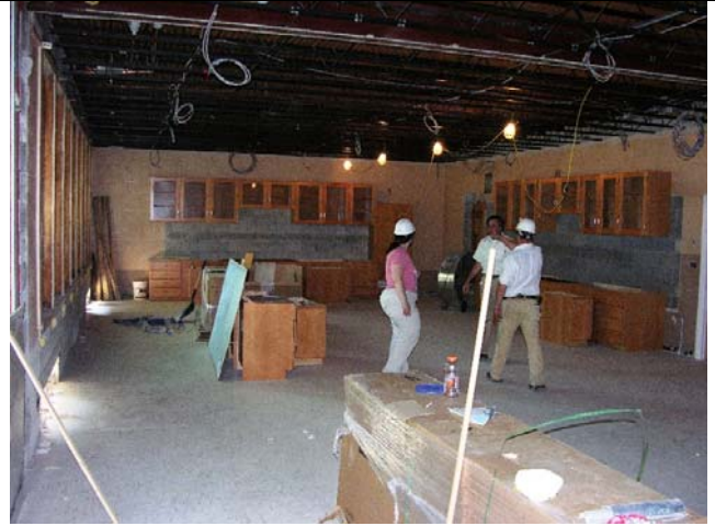
Installation of science room flooring and casework.